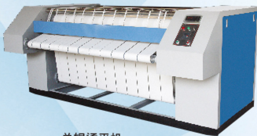
单辊烫平机 Single roller ironing machine

YP series roller ironing machine has the advantages of simple and reasonable structure, large ironing range, low energy consumption, safe and reliable performance. Infinitely variable speed, users can select the appropriate ironing speed according to the needs of different fabrics and ironing conditions. The material conveying system uses high-quality shaped wide spindle belts to avoid the swimming phenomenon that is difficult to solve in the transmission of wide canvas. The drying cylinder is exquisitely made of high-quality stainless steel, which has the advantages of speeding up, anti-corrosion, and easy drying of the fabric. There are three heating methods available: steam heating, electric heating, and gas heating.