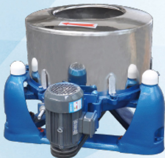
600型脱水机 600 Type dehydrator